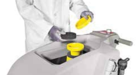
For effective vacuuming, the suction filter must be kept clean.

To ensure a perfect dry surface, the suction hose and the squeegee rubber blades must be cleaned at the end of any cleaning operation. The squeegee can be lifted to quickly clean the rubber blades.