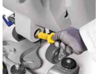
Easy access to clean solution filter.